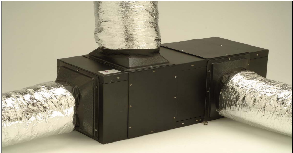
Wine Guardians ductable supply and return for evaporator and condenser sections