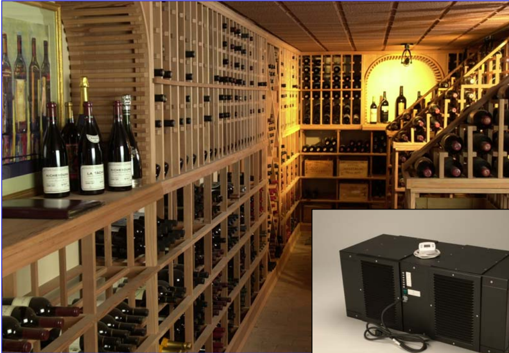
Above, Wine Guardian application for a 10,000-bottle restaurant wine cellar. Inset, 1/4 ton Wine Guardian unit.

Wine Guardian environmental control systems...superior performance and reliability for all of your residential and commercial wine room conditioning needs. Completely self-contained through-the-wall or remote systems provide optimal temperature and humidity control for the preservation and enjoyment of your wine investment.