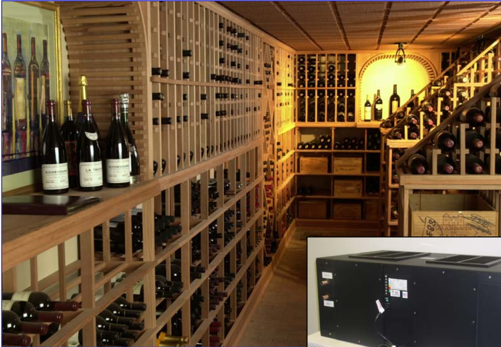
Above, Wine Guardian application for a 10,000-bottle restaurant wine cellar. Inset, 1/4 ton Wine Guardian unit.

Wine Guardian environmental control systems...superior performance and reliability for all of your residential and commercial wine room conditioning needs. Completely self-contained through-the-wall or remote systems provide optimal temperature and humidity control for the preservation and enjoyment of your wine investment.