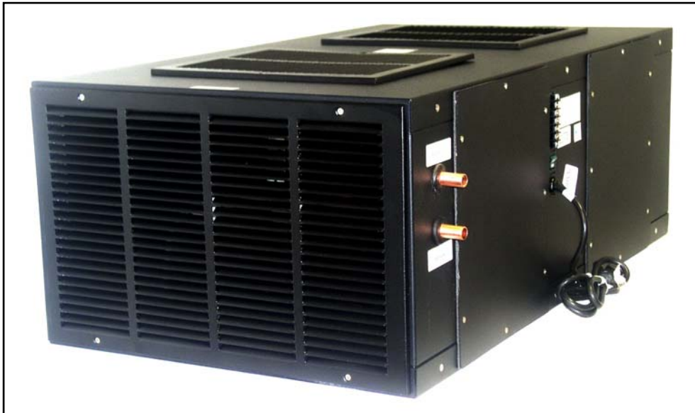
Wine Guardian water-cooled unit with ductable supply and return evaporator section.